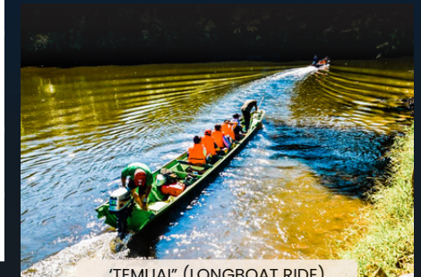
'TEMUAI' (LONGBOAT RIDE)